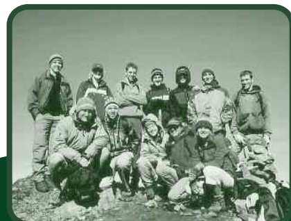
U of C at HIGHWOOD PASS

The summer is now a memory, but the work of our mission continues. Several young leaders have stayed on with us helping host schools and groups this fall and winter. God is transforming them through a rhythm and discipline of work, study, prayer and community living. It is our desire and prayer to see more young leaders have this opportunity. This is one way that Pioneer Ranch Camp's mission of transforming youth, students and graduates is growing into a year round work. I believe the wind of the Spirit is blowing.